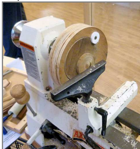
The jig in close up (left) and some results (below).