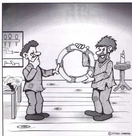
Early attempts at the Circular Saw.