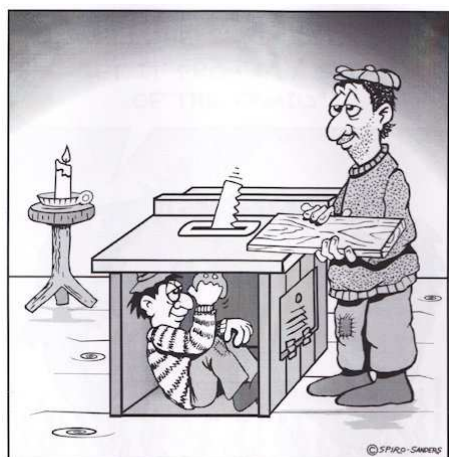
Early attempts at the table saw.