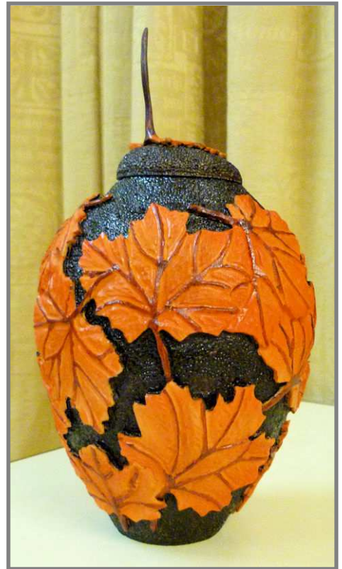
"Autumn Fall", hollow vessel, carved, coloured and pyrographed.

It would be nice to see more items on the display table. They can include "work in progress", disasters, special tools or jigs you have made. Or even turned items that you are pleased with!