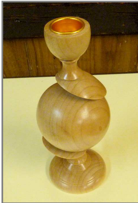
Offset turned candlestick, inspired by Simon Hope demonstration.