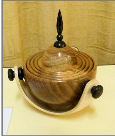
Hugh Field's suspended bowl