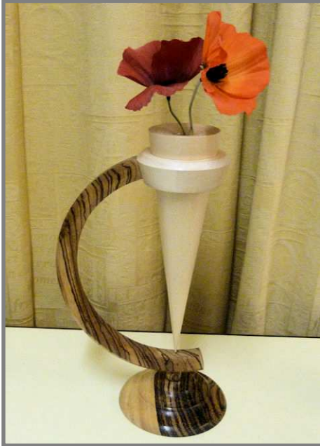
Vance Lupton's specimen vase

This was for an item assembled from at least three turned components. It attracted four entries which were placed as follows: