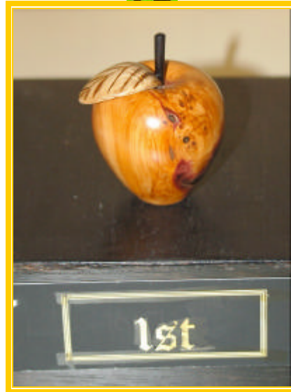
First place – Tom Young