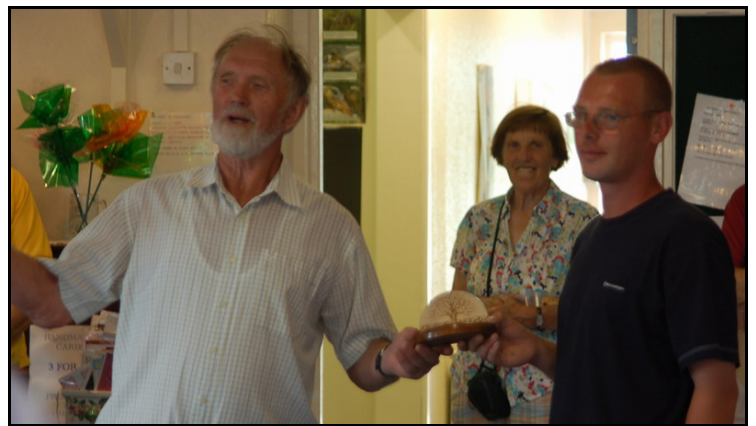
Hedge laying presentation