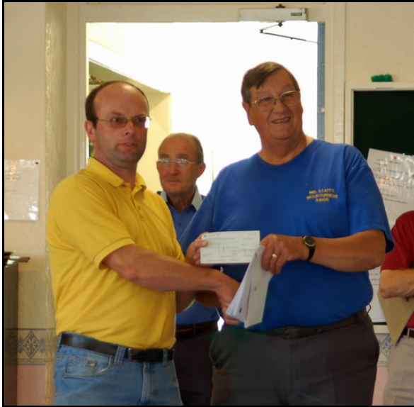
Presentation of MSAW cheque.

I don't know how much was raised but several club members turned up on the day and thoroughly enjoyed themselves.