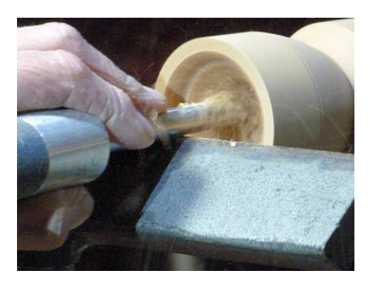
Further shaping of the outside came next, followed by sanding and waxing as for the box.