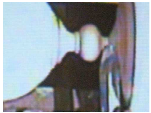
After removing the tail centre and parting off the waste portion, the knob was finished using careful light cuts.