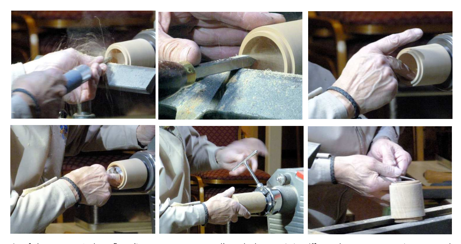
tip of the gouge. A short flute (i.e. a worn out gouge!) works best as it is stiffer and a more aggressive cut can be achieved by using more of the wing of the tool.

The sides were squared up using the square skew chisel, long point left, and then by moving the handle to the right, the bottom of the box was cleaned up prior to sanding with wax, this reduces the heat build up and fills the grain by producing a slurry. The inside was wiped out with clean tissue and then buffed with more wax. The box was removed from the chuck and the previously parted off piece mounted.