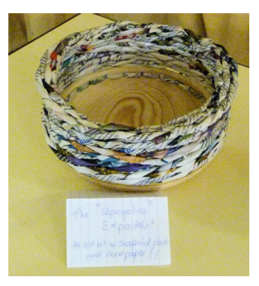
Dawn's "upcycling experiment" using part of a scaffold board and newspaper. An interesting idea!