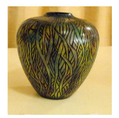
A close up of the decoration on the sycamore one.