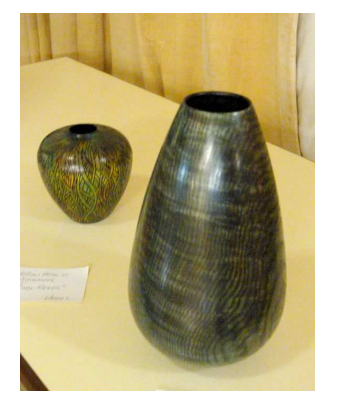
Vance's hollow vessels in sycamore and ash.