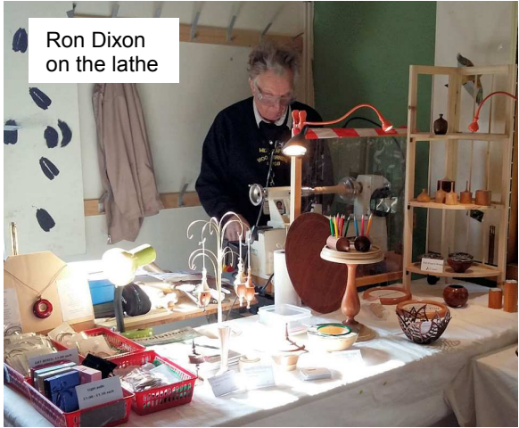
This event is perhaps a little early in the year and is not as well attended as the Christmas Fair.

We attend these shows to publicise the club, hopefully to increase our membership, and to make a modest contribution to club funds.