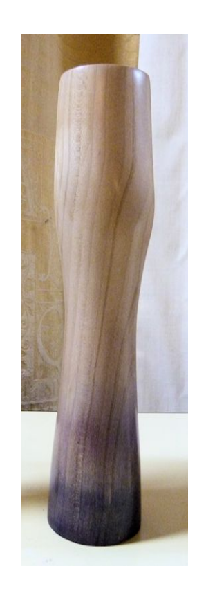
1<sup>st</sup> place – Hugh Field 2<sup>nd</sup> place – Philip Watts